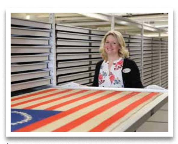
The Museum has 180 Regimental and National Civil War Battle Flags in its collection.