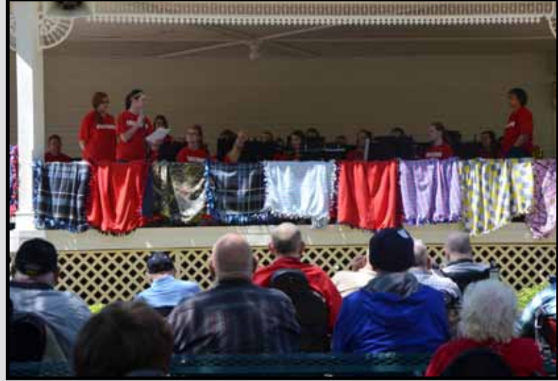
The Freedom 8th Grade students donated iTunes cards, handmade blankets, crossword puzzle, and several iPods.