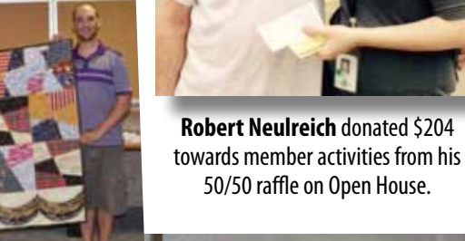
Portage Co. RSVP Silver Threads from Stevens Point, WI donated quilts, pillowcases, catheter bag covers, walker bags, a fleece throw and a musical theme wall hanging quilt.

WE NEED YOUR HELP: When making a donation, please provide the full name, phone number and complete address (including zip code) of the person or group to be acknowledged.