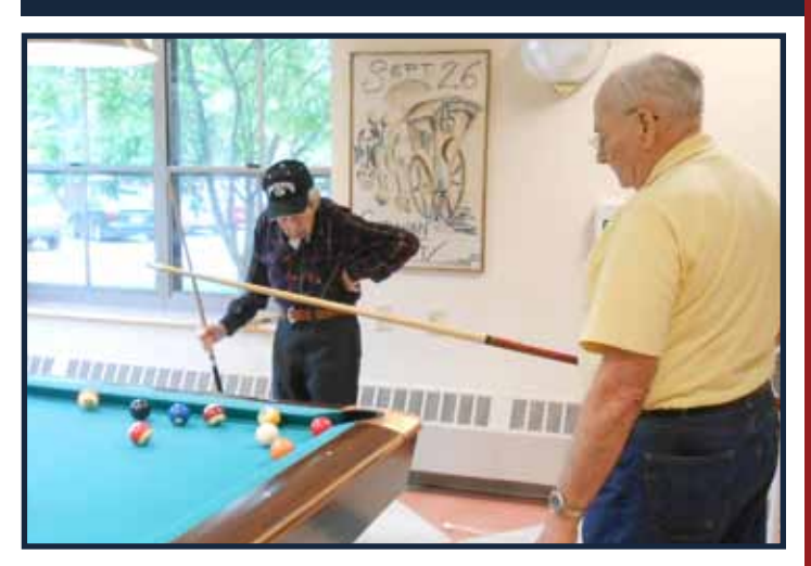
The Pool Sharks at AH