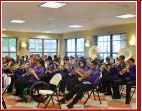
Waupaca Middle School