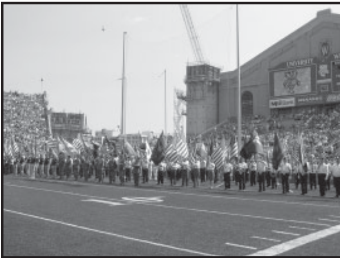
Thirty-nine color guard units stand in front of the UW fieldhouse.

The University of Wisconsin (UW) Badger football game on September 6, 2003 featured a pre-game Salute to Veterans as 39 color guard units from veterans groups statewide marched onto the field during the pre-game show before the UW met Akron. Led by Secretary Raymond G. Boland, the color guard units presented the colors and a fine display. The oldest included World War II veterans and the groups from farthest away were from Lac du Flambeau.