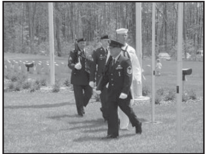
Military Funeral Honors Team at NWVMC is shown marching.