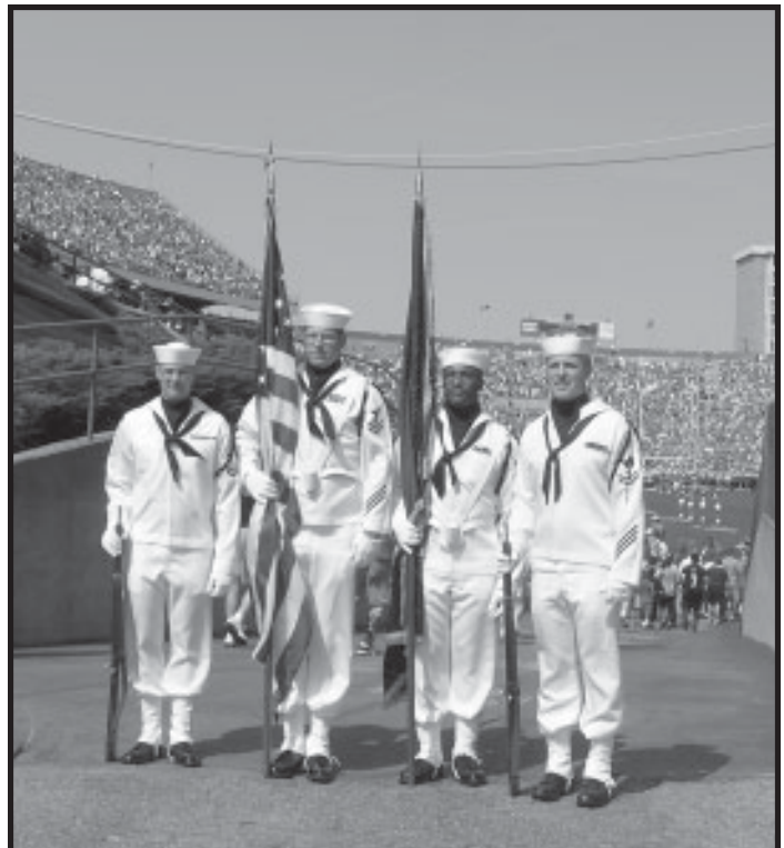
Naval Reserve Unit color guard.