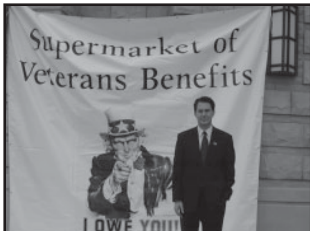
Milwaukee County Executive Scott Walker extends thanks to WDVA on behalf of Milwaukee County's veterans.