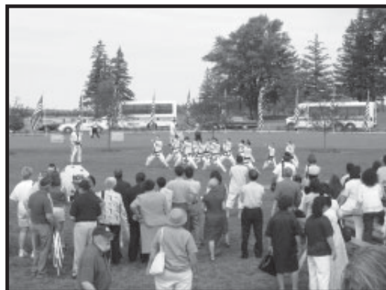
Tae Kwon Do demonstration that took place after the ceremony at SWVMC.