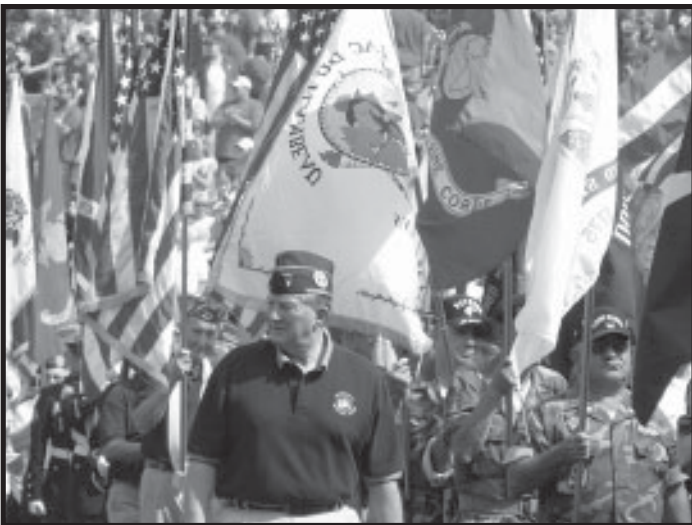
Boland and marchers leave the field.