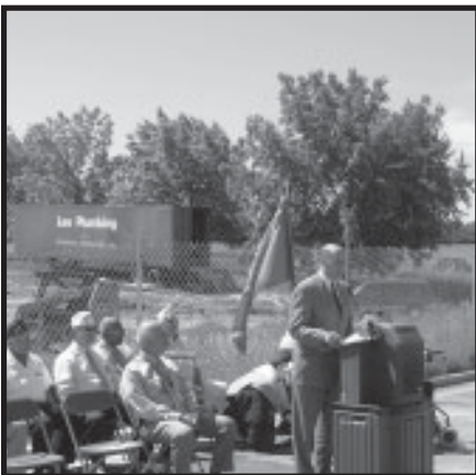
Governor Jim Doyle announces budget provision for expansion at Wisconsin Veterans Home at Union Grove.

At a news conference July 16 at the Southern Wisconsin Center campus, Governor Jim Doyle announced he would approve funding in the 2003–05 biennial budget to open a new 120-bed Skilled Nursing Facility (SNF) at the Wisconsin Veterans Home at Union Grove.