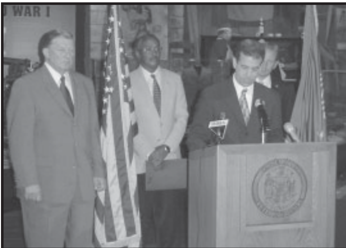
Senator Feingold unveils his bill at the Wisconsin Veterans Museum in Madison.