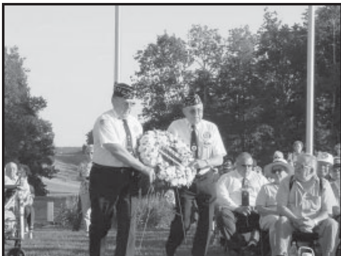
Members from Rice Lake American Legion Post #87 presented the wreath at NWVMC.