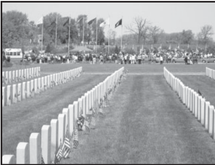
Memorial Day ceremony viewed from markers at the SWVMC.

Observances to commemorate Memorial Day were held on May 25 and 26 at various locations statewide. The Wisconsin Department of Veterans Affairs held ceremonies on May 25 th at the Northern Wisconsin Veterans Memorial Cemetery (NWVMC) at Spooner, and on May 26 th at the Southern Wisconsin Veterans Memorial Cemetery (SWVMC) at Union Grove and at the Wisconsin Veterans Home at King.