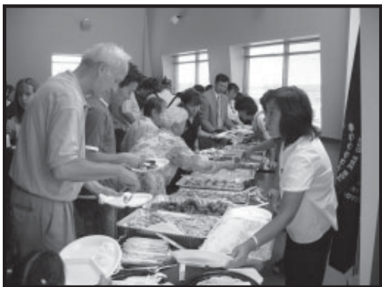
Sampling a "Taste of Korea."