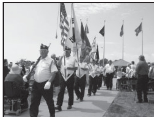
Korean War Veterans Association color guard unit retires the colors.